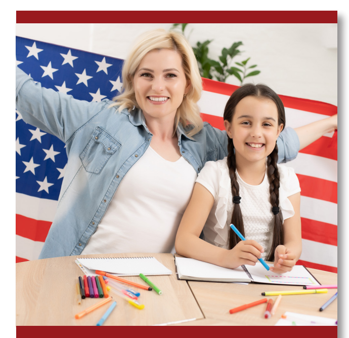
Recognize teachers who care about America!

Based on the nominees submitted, VFW chapters, called Posts, will recognize teachers in the following categories, K-5, 6-8 and 9-12. Posts then submit these winners' names and required documents to their District-level judging, if applicable, who will forward their winners to the Department (or state) level. After judging, each Department then forwards their winners to VFW National Headquarters for consideration in the national awards contest.